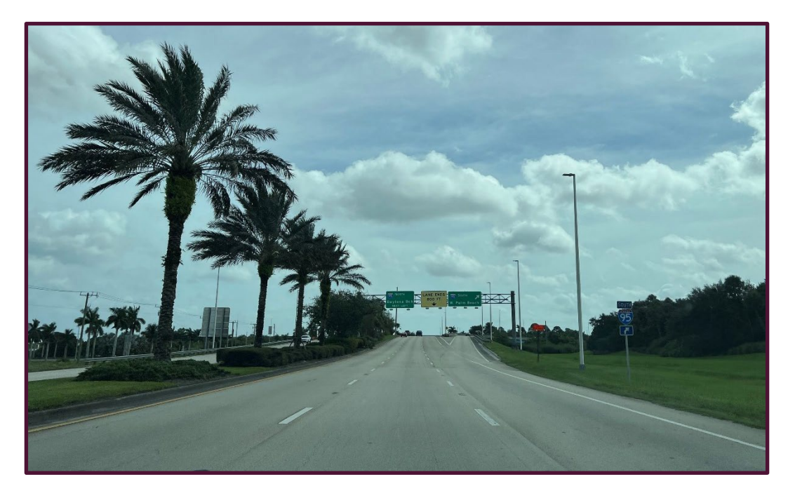
Eastbound SR 706/Indiantown Road (Pre-Construction)